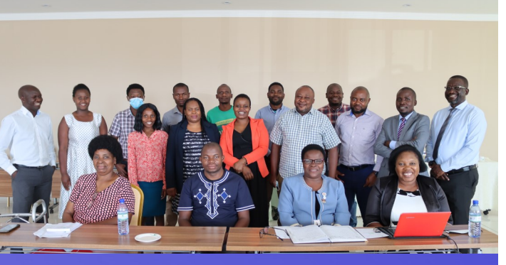
2021—NONM delegates, Partners Pose for a Photo After a Check-off System Meeting in Mponela

Realizing the role which information, communication and technology plays in the present world, NONM also works to improve the same through various initiatives including having communications human resource to handle communication tasks, exploit new technologies relevant to the organisation and help members and partners access information easily.