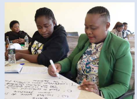
Attendees writing down what they will implement when they go back

applied to strengthen our branches and improve the working conditions of our members. Together, we will continue to drive positive change across Malawi's health sector. The trainings which are targeting 30 shop stewards per zone would not have been possible without the generous financial support of our longstanding development partners, the Norwegian Nurses Organisation. Their contribution has been vital in ensuring that we can continue to educate and empower our members.